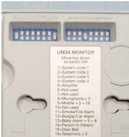
Mobile Phone Set 5, 9 & 16