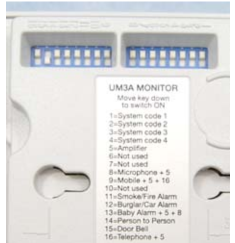
Doorbell Set 15