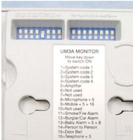
Car & Burglar Set 12