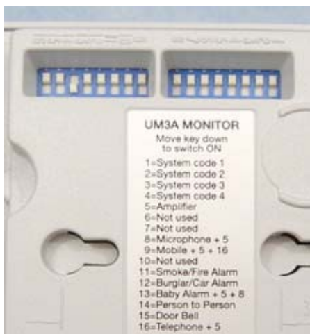
Person to Person Set 14