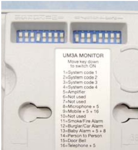
Baby Set 5, 8 & 13