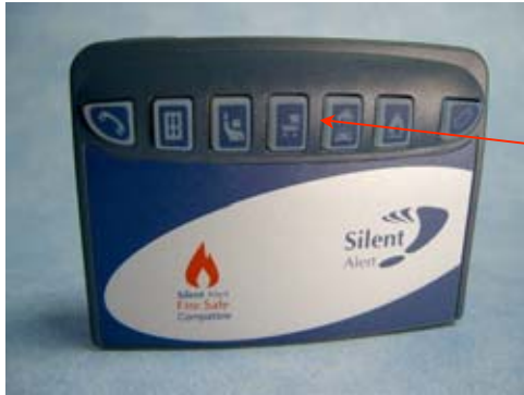
Sure-key™ Interactive Keypad

Part of the SA3000 Paging System for deaf and deaf-blind people